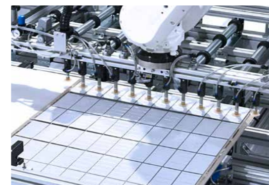
String handling into tray or onto glass panel