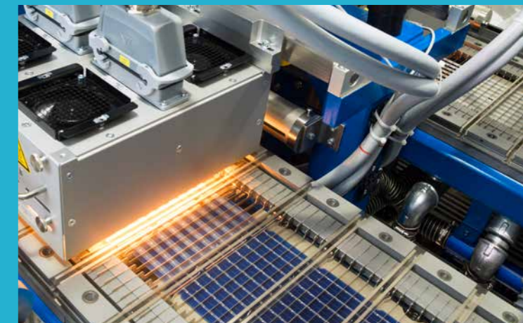
Closed loop IR light soldering process