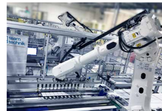
145 MW – the powerful package